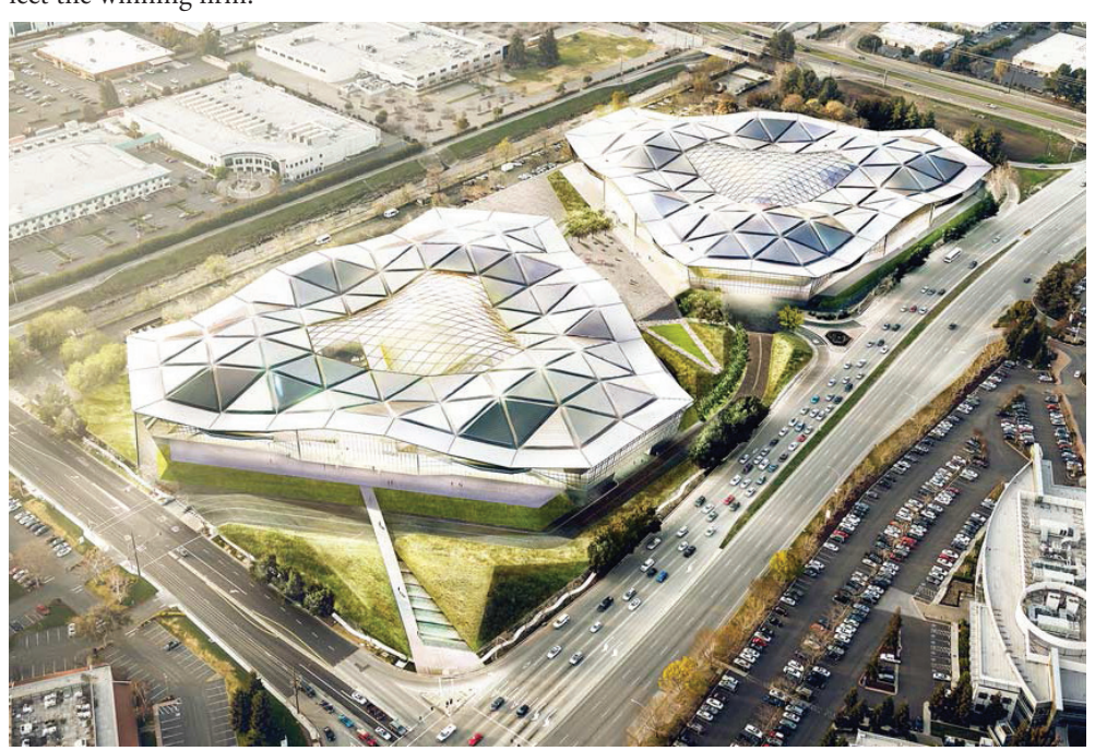
Nvidia Headquarters, Santa Clara

Source: http://california.construction.com